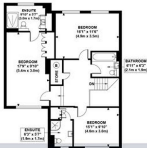
FIRST FLOOR GROSS INTERNAL FLOOR AREA 969 SQ FT