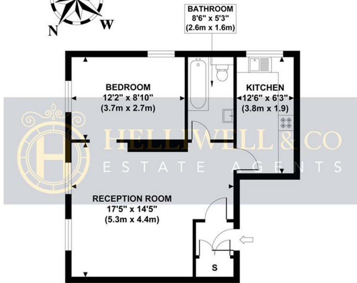
FIRST FLOOR GROSS INTERNAL FLOOR AREA 483 SQ FT