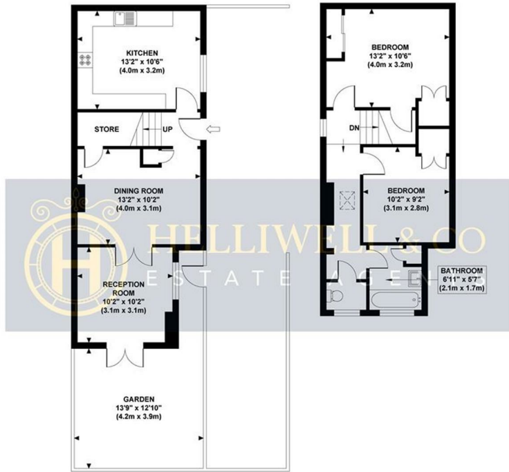
GROUND FLOOR GROSS INTERNAL FLOOR AREA 432 SQ FT