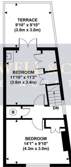
FRIST FLOOR GROSS INTERNAL FLOOR AREA 315 SQ FT