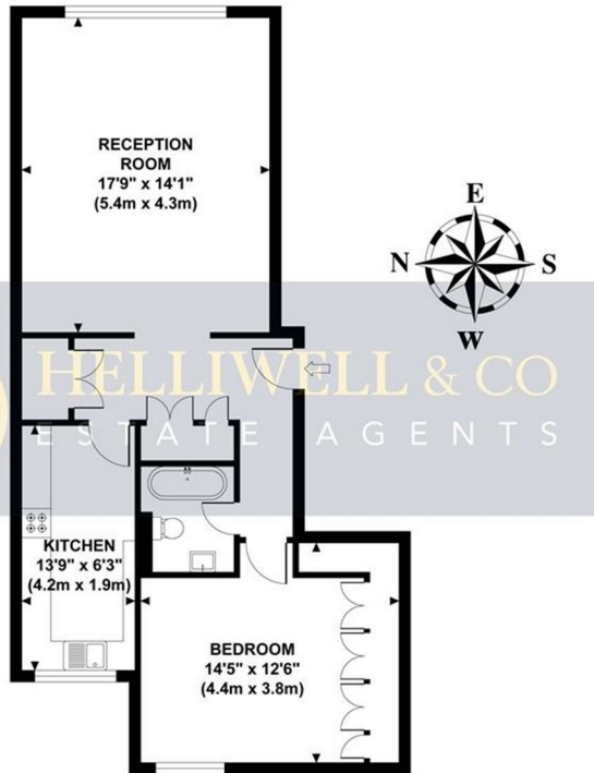
GROUND FLOOR GROSS INTERNAL FLOOR AREA 656 SQ FT

Approximate Gross Internal Area 656 sq ft / 60.90 sq m